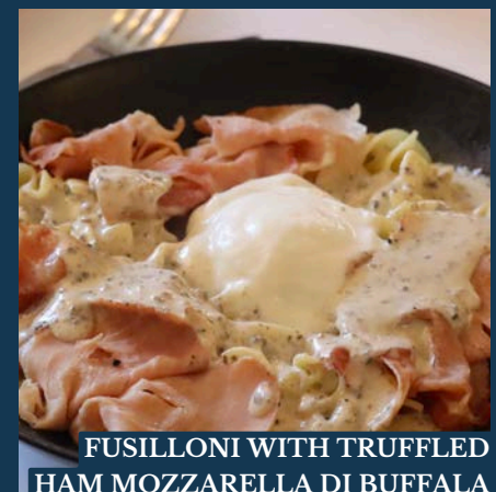
FUSILLONI WITH TRUFFLED HAM MOZZARELLA DI BUFFALA